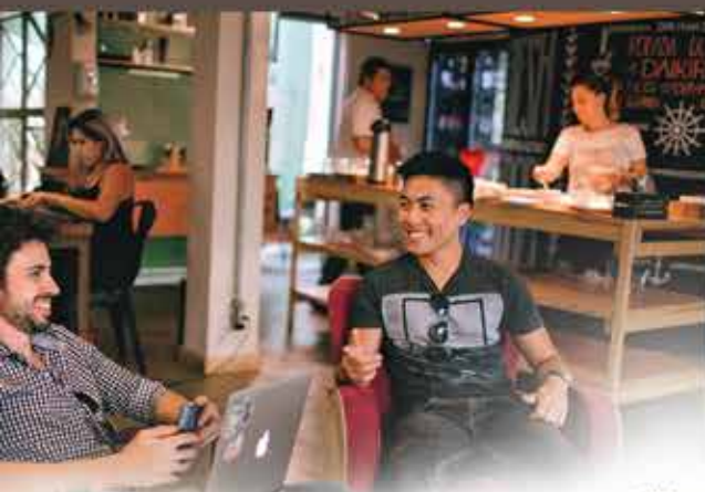
Vibrant Communal Living