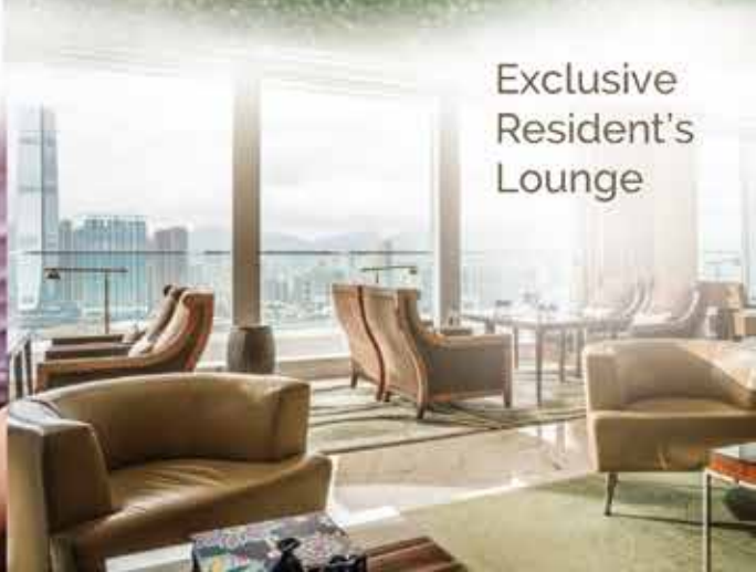
Exclusive Resident's Lounge