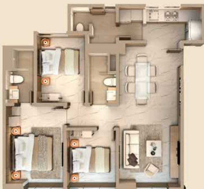
PENTHOUSE 4 Bedroom | SGA: 150.50 sqm